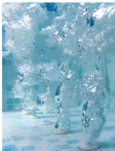
Closely spaced nozzles for an even spread of bubbles on water's surface

Closely spaced nozzles create a stunningly even spread of bubbles on the water's surface.