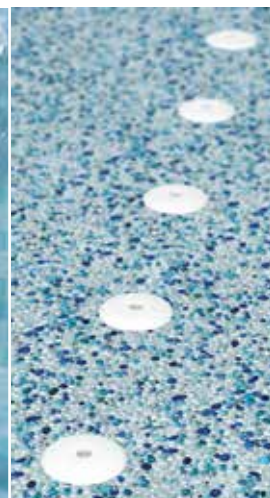
Neat and discreet finish in pool interior