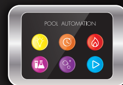
POOL CONTROLLER COMPATIBLE*